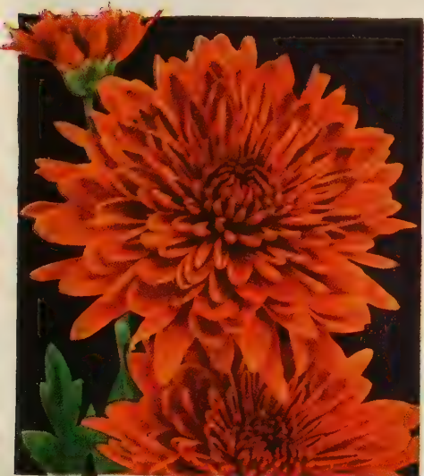
CYDONIA. 50c each; 3 for $1.25